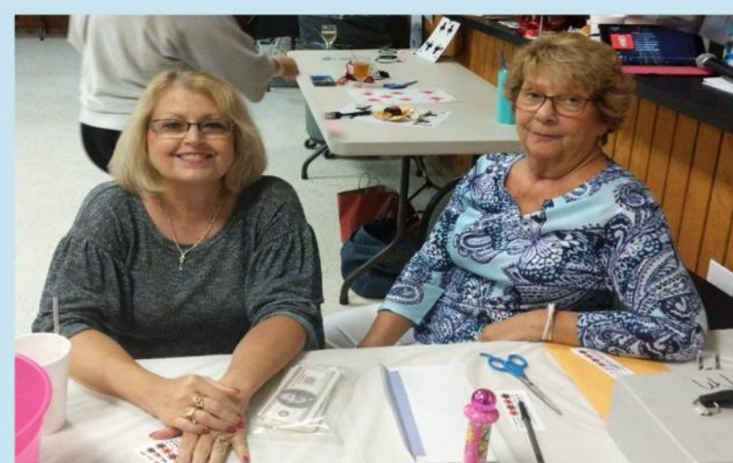
Everyone enjoyed the refreshments