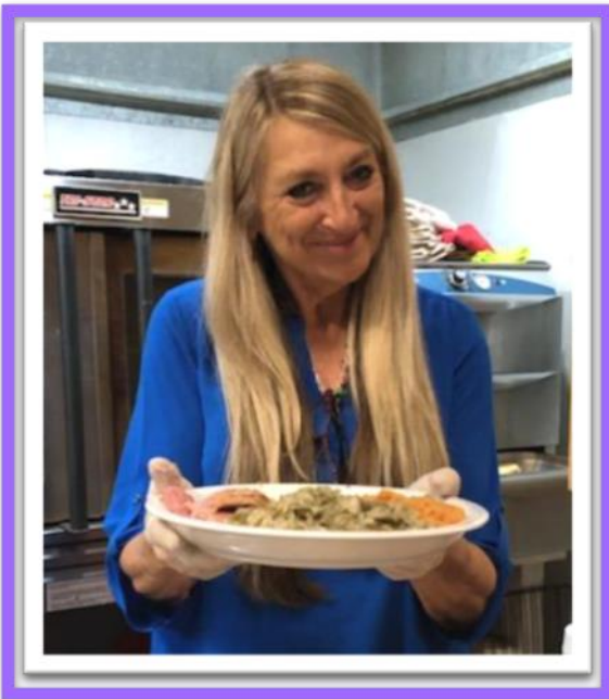
The Christmas meal was a big hit.