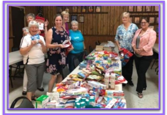
The ladies prepared and delivered stockings for soldiers