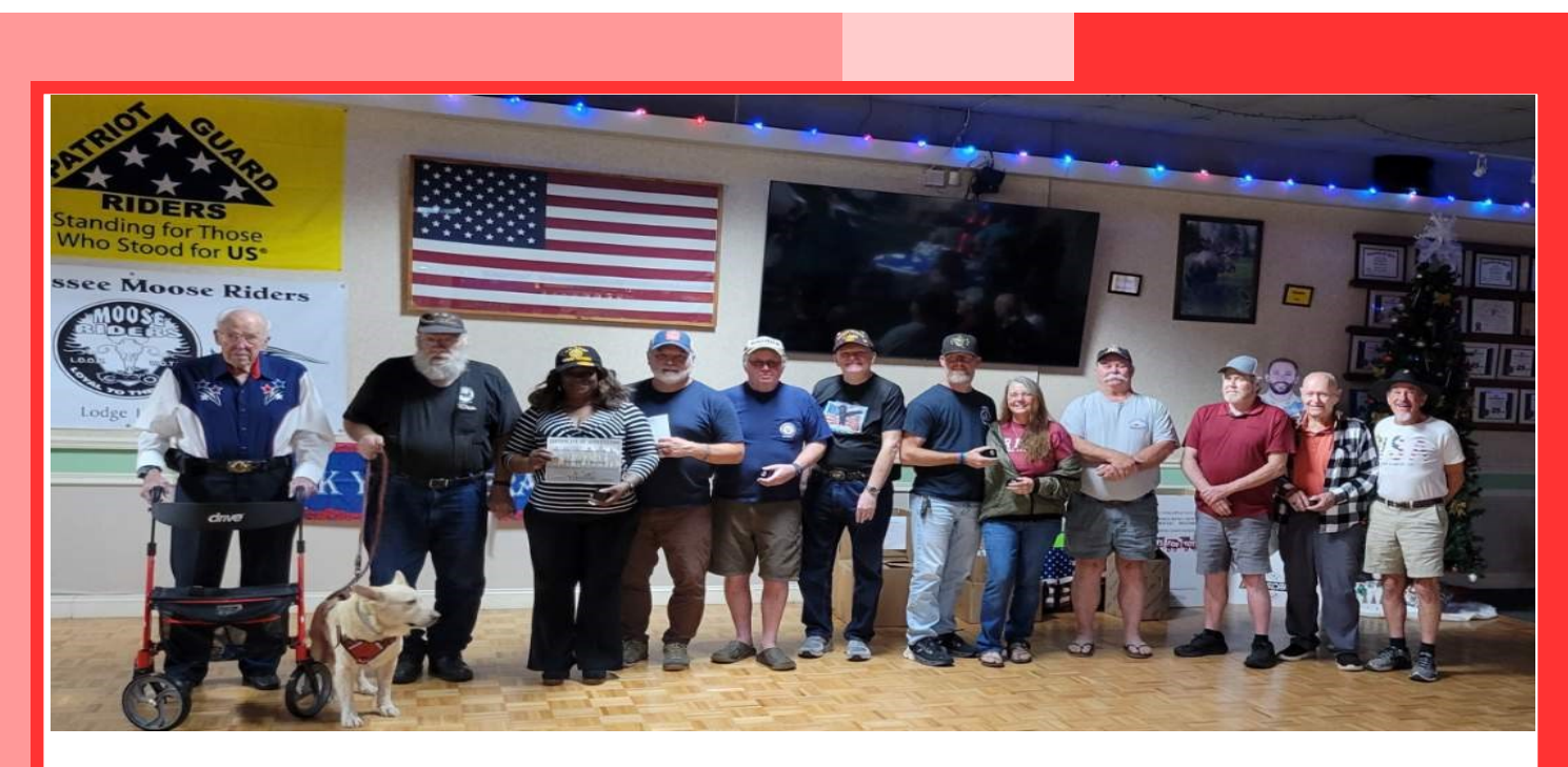
Members receive a the Valued Veteran Certificate