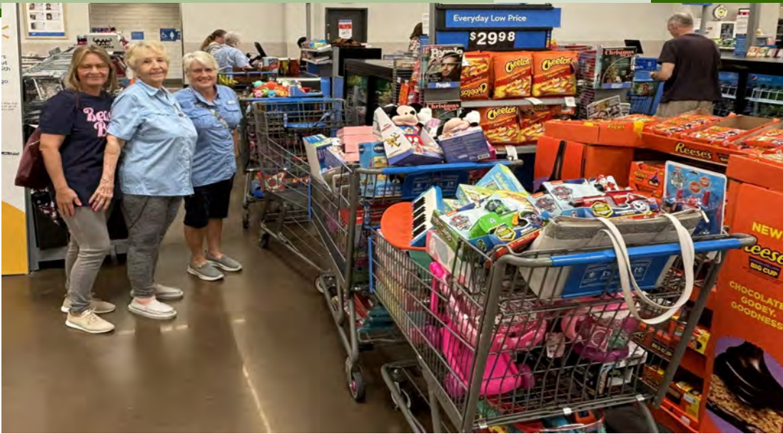
Giving Christmas To Those In Need