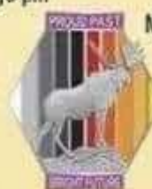
Moose Legion/ WOTM pin