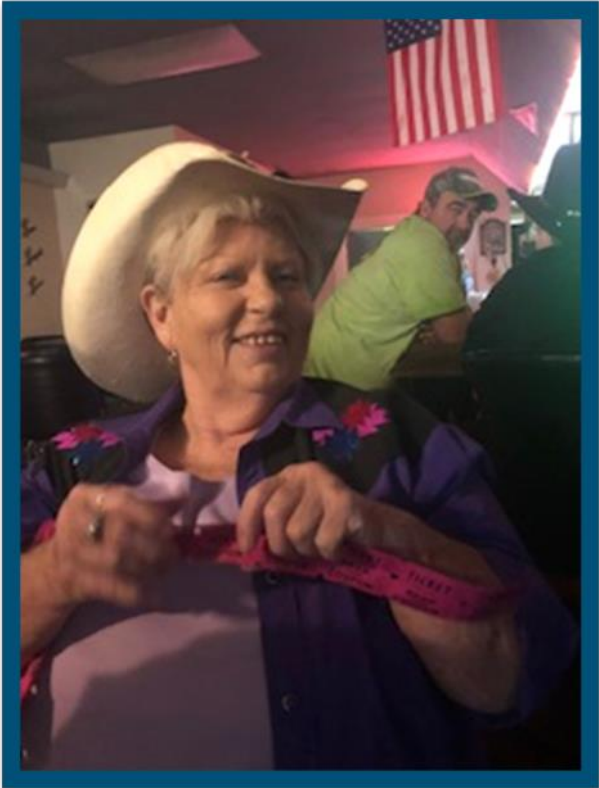
WOTM Hoe Down