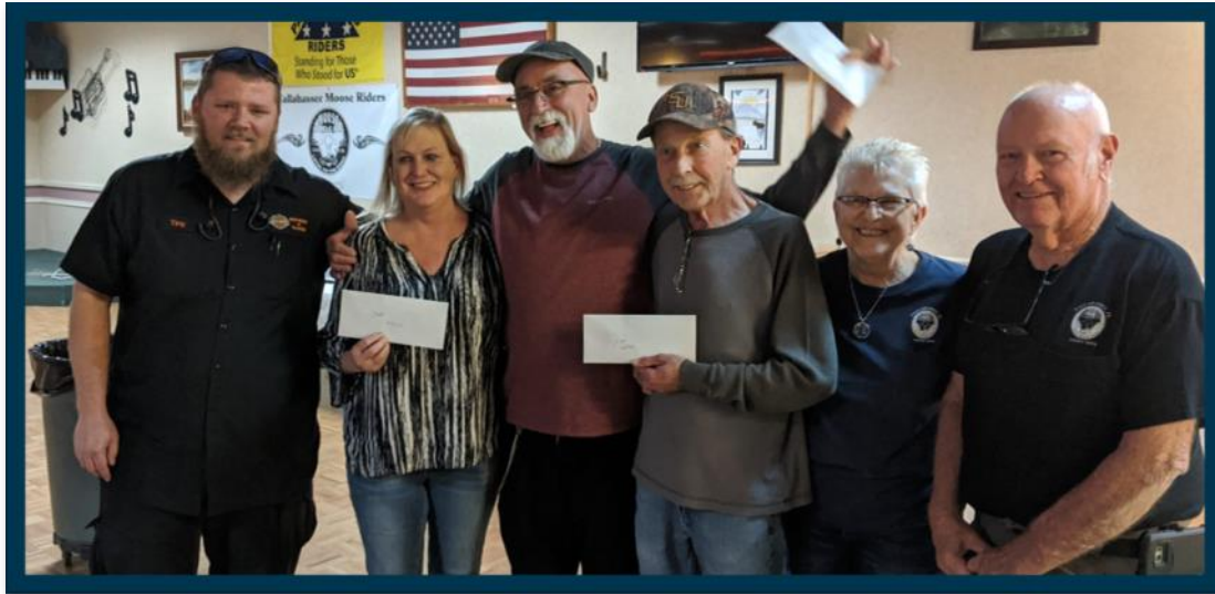
Chili Cook off