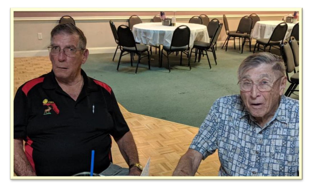
Hey, don't interrupt our eating!