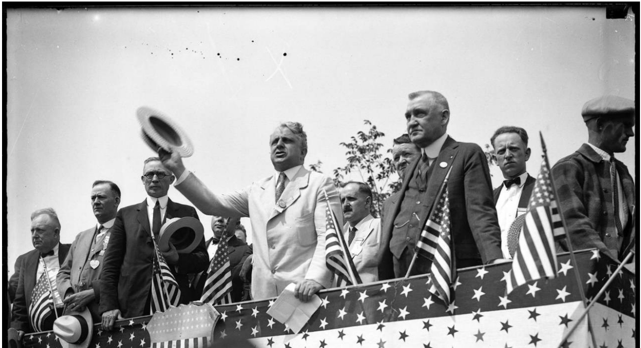
Moose convention at Mooseheart, Ill. circa July 3, 1926