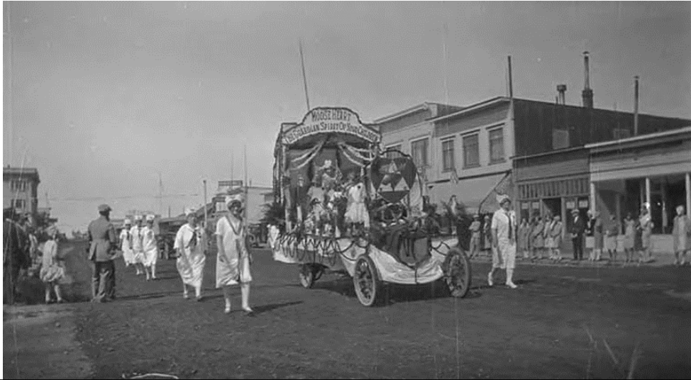
Mooseheart float in Fourth of July parade along Fourth Avenue, Anchorage, Alaska between 1930 and 1936.

There is long tradition of celebrating the 4th of July by the Moose!