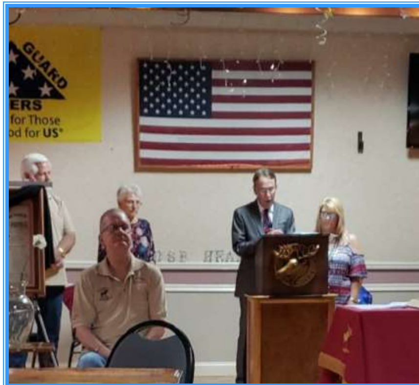
Memorial Days Service. Honoring those who served.